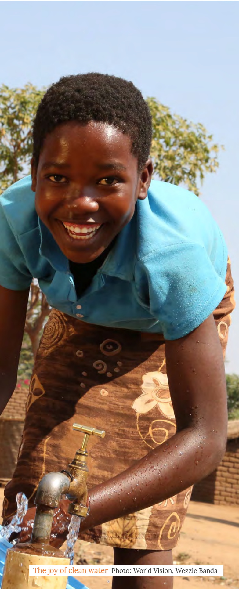
The joy of clean water