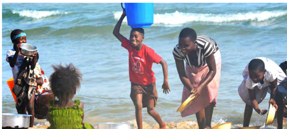
Neque alit volorro vitiae num, omniasp elest, sitios enimulpa quas molorpos nis

“My grandchildren are now doing better in school because they are attending classes every day. I am happy