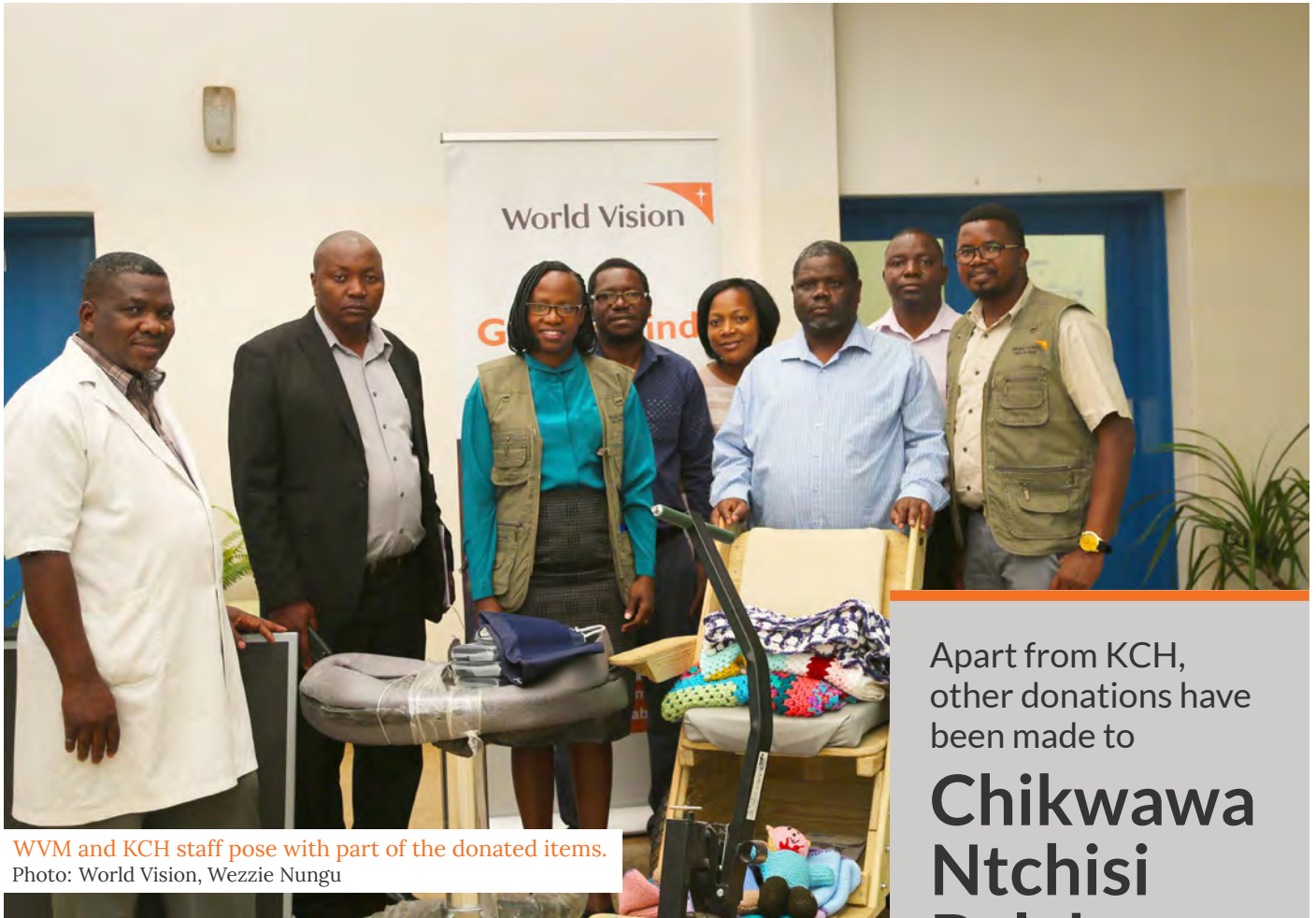
WVM and KCH staff pose with part of the donated items.

Apart from KCH, other donations have been made to