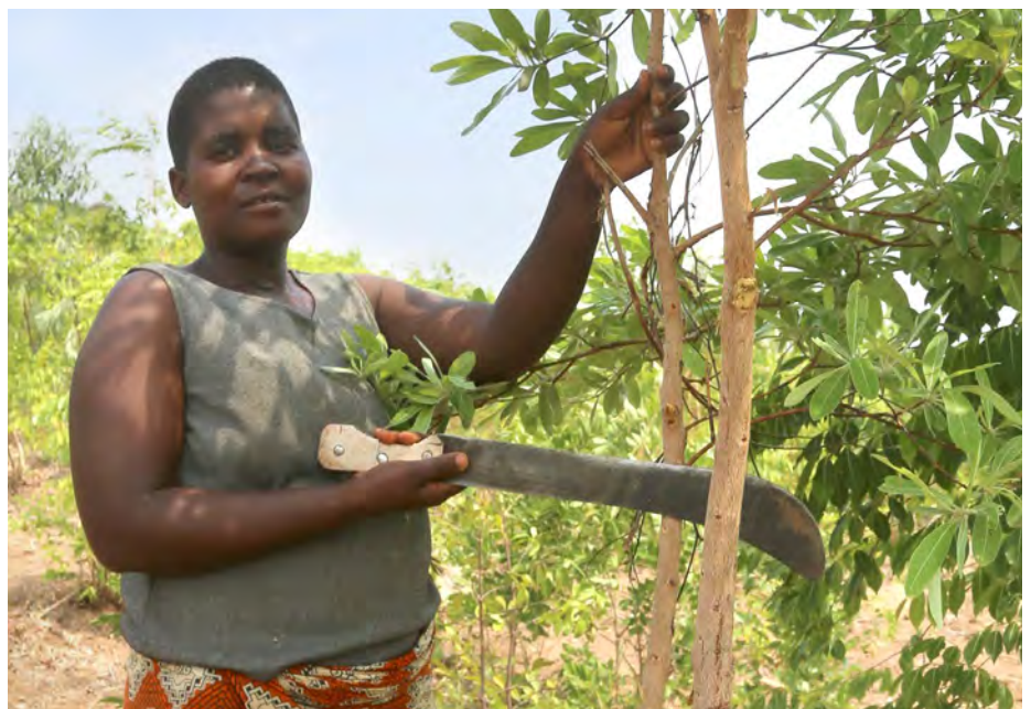
A Woman pruning a tree in Zomba.

“This is our own project and World Vision and its partners have just come to support us. Even after they leave, we shall be using the knowledge they have given us.”