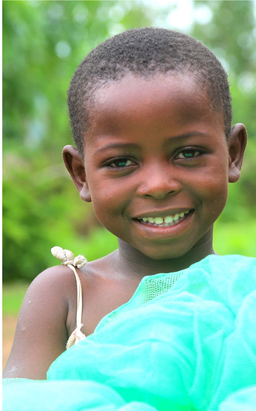
A child holds her mosquito net in Chiradzulu.

The prevalence rate for malaria in Malawi's rural areas is as high as 30 percent while in urban centres it is at 4 percent.