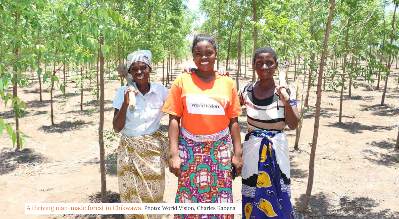
A thriving man-made forest in Chikwawa.