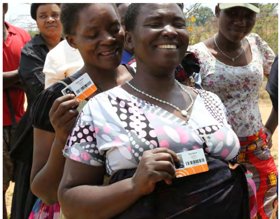
Beneficiaries showing off their LMMS cards.

As both a root cause and a consequence of poverty, malaria robs people of productive hours of work. Furthermore, the human suffering and loss of life caused by malaria is often matched by the economic burden placed on families who bear the direct costs from their own pockets. Personal expenditure includes spending on insecticide-treated nets, doctors' fees, anti-malaria drugs, transport to health facilities, support to the patient and funeral costs. This puts an unbearable strain on household resources ■