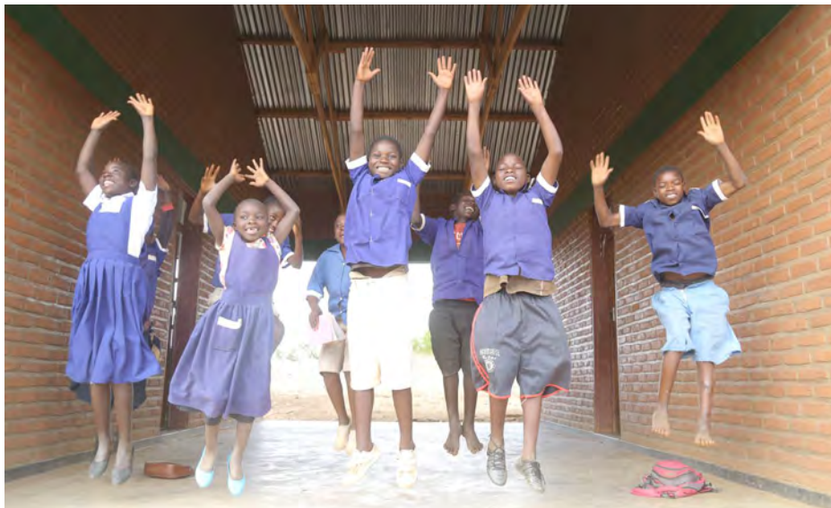
A Jump of happiness. Children at Kanamwali School

Just two years ago, a visit to Kanamwali Primary School in Tchesa Community in Dedza would leave you with two things; shock and sympathy.