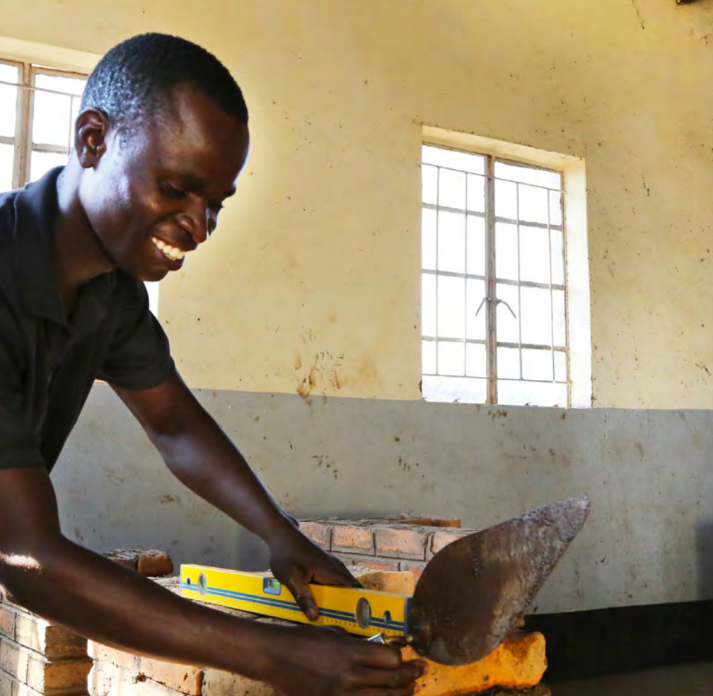
Young people have acquired various skills.

Communities were taught and empowered to own the development projects right from the planning, execution, monitoring and reporting.