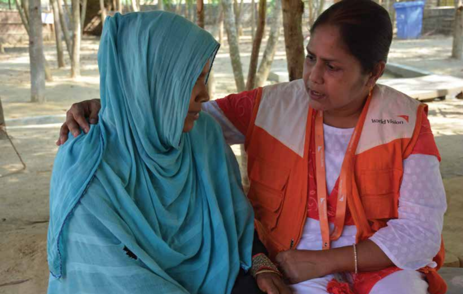
Women and girls find the psycho-social support they need at our Women's Peace Centre.