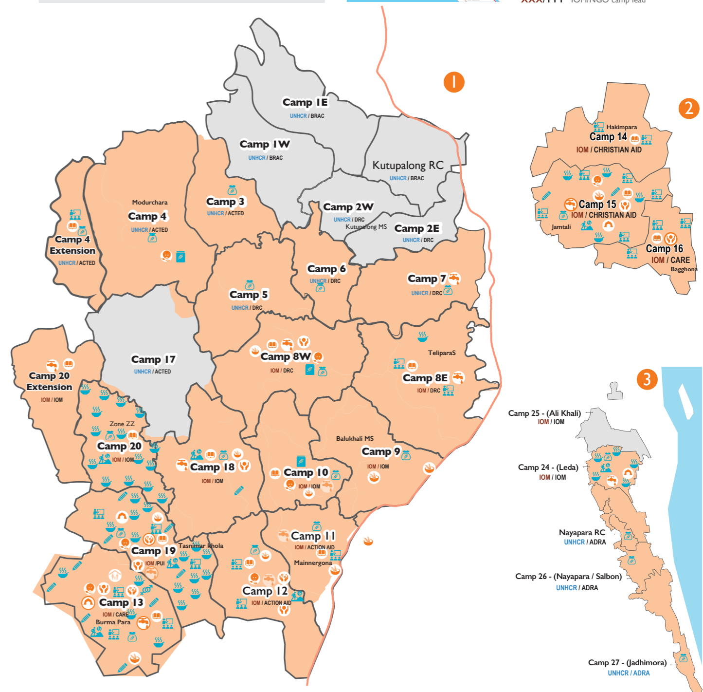
Kutupalong-Balukhali expansion site, known as the "mega camp"