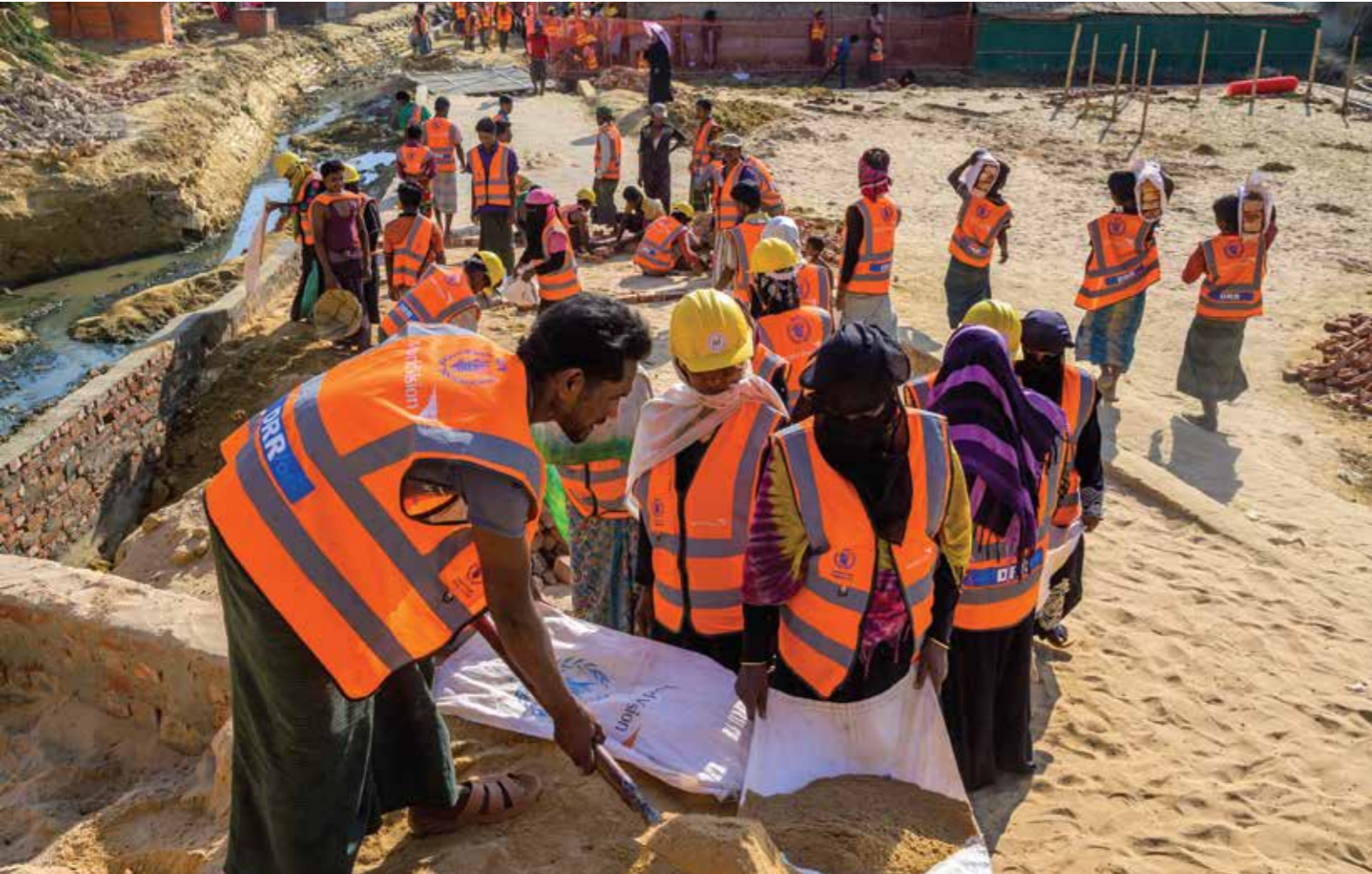
WorldVision engaged 14,922 refugees, including 1,906 women, in cash-for-work projects to prepare the camps for the monsoon season.