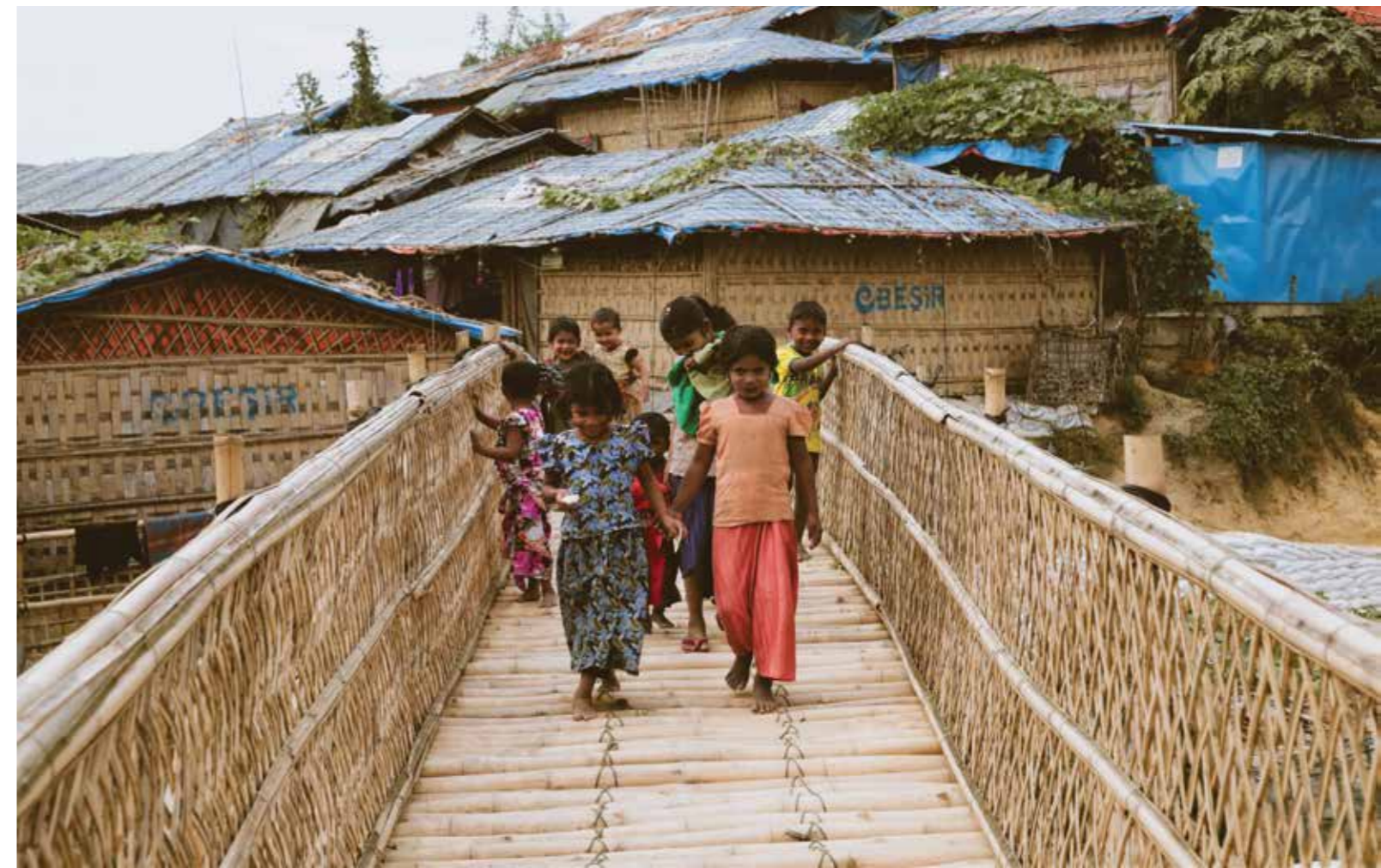
Children are better protected from floods and landslides, thanks to bridges and culverts built by their parents.

Earning an income gives women and men choices and a sense of control over their lives—something many feel they lost in the frantic flight from Myanmar.