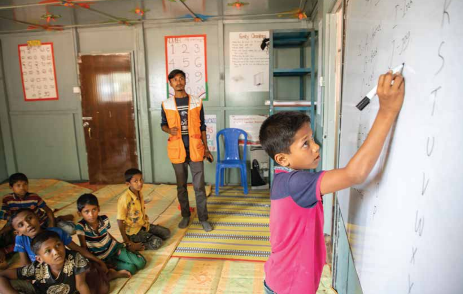
Listen directly to children and adolescents about what they need and want, especially regarding education.