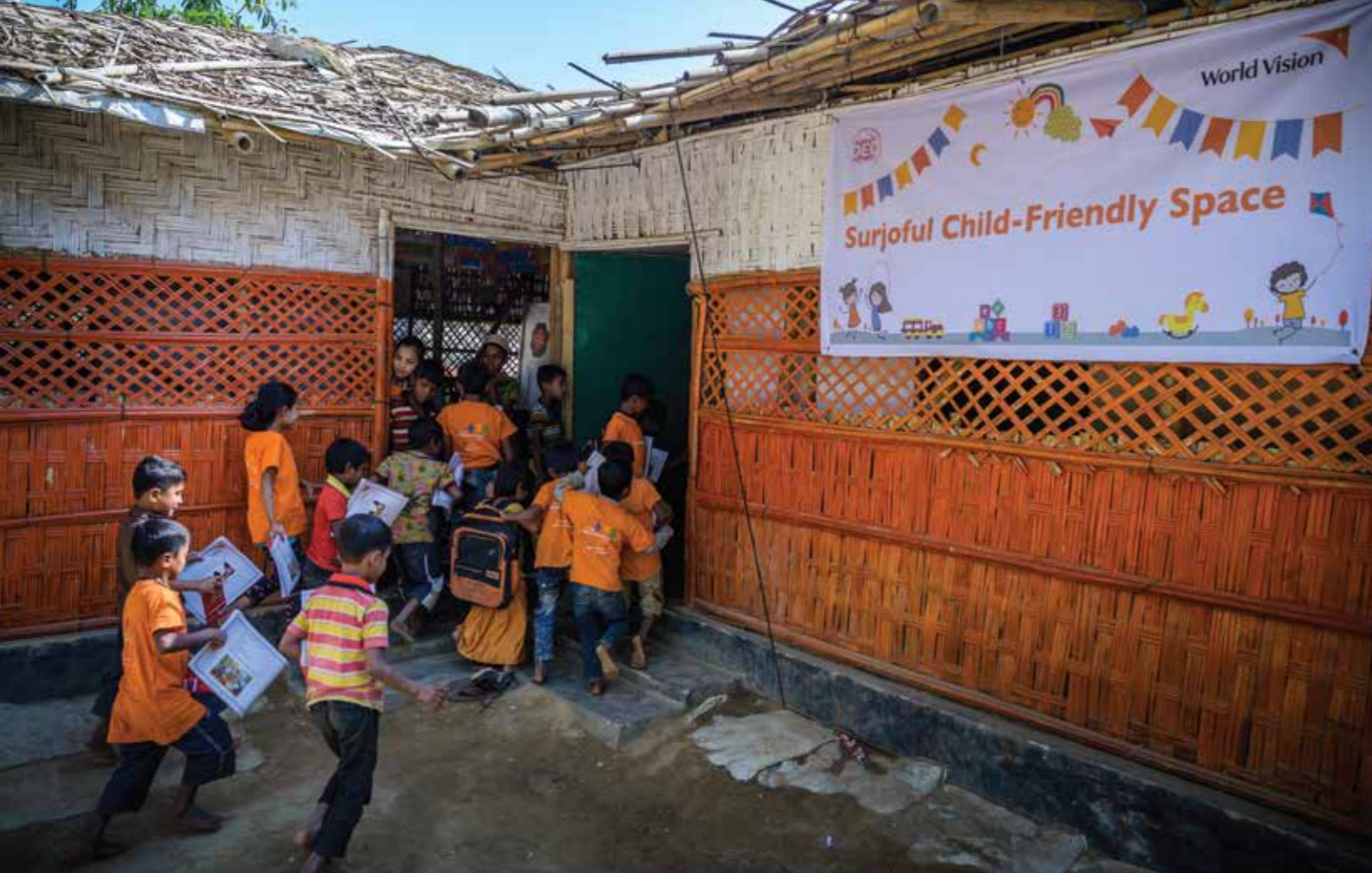
Children pile through the door at one of World Vision's 12 centres where more than 3,100 children age 3-14 are enrolled.