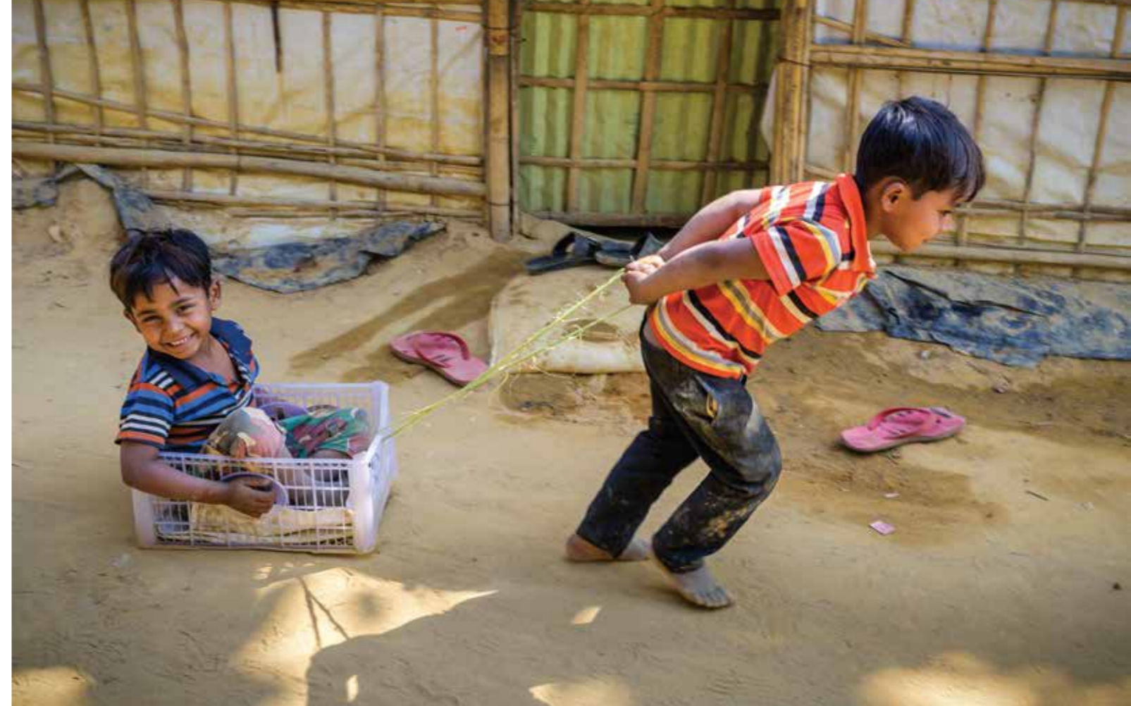
Without the protection of schooling, many children play unsupervised in the hazardous camps or are often forced to work.

To mitigate a deepening protection crisis, a comprehensive refugee response is needed that addresses the needs of both refugee and host communities. Durable solutions are required that build the resilience of communities to mitigate shocks and stresses. This includes safe, adequate and dignified housing, high quality, relevant and inclusive education, and access to income-generating activities.