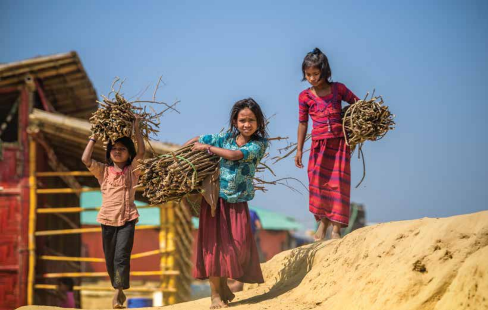
Fewer children fetch firewood for their families now that their mothers can cook on gas stoves at our community centres.