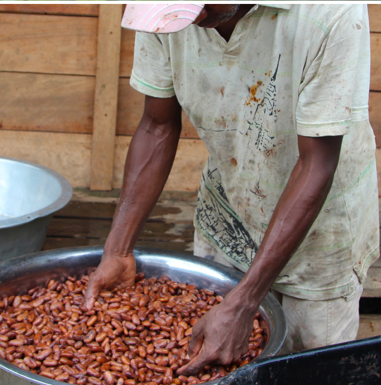
Creating market links towards business partnership is the next biggest challenge for any local cocoa farmer in the Solomon Islands.