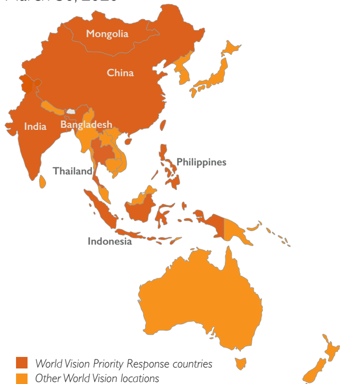
COVID-19 # OF CASES AND DEATHS, BY COUNTRY countries in Asia-Pacific where World Vision is present, as of March 29th