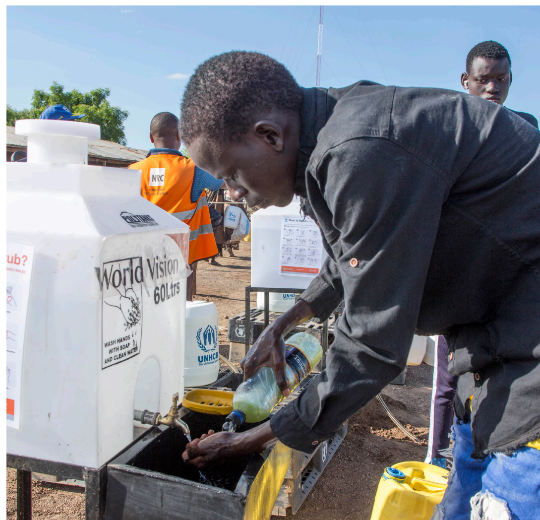
World Vision Kenya is promoting recommended hygiene practices and social distancing measures while distributing food to enhance the well-being of children and families at Kakuma Refugee Camp.