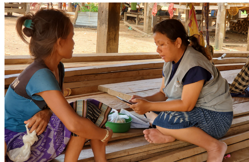
Pictures from Saysettha District, Attapeu Province (left) and Saravane District, Saravane Province (right).

In July-August, AHAN conducted its Mid-Term Review in 10 target villages across the 3 provinces.