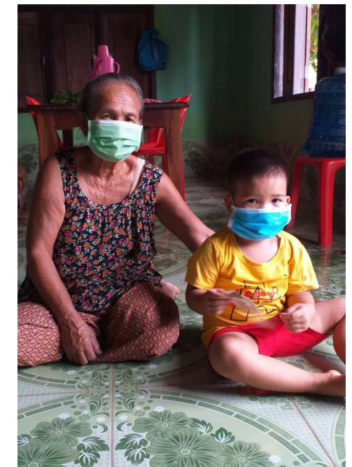
Community-Led Total Sanitation or Saving Group activities in Attapeu, caring for children during quarantine times in Savannakhet... COVID-19 have had a permanent impact in the lives of the communities, still visible whether it is by practicing hand-washing more regularly or by wearing a facemask.