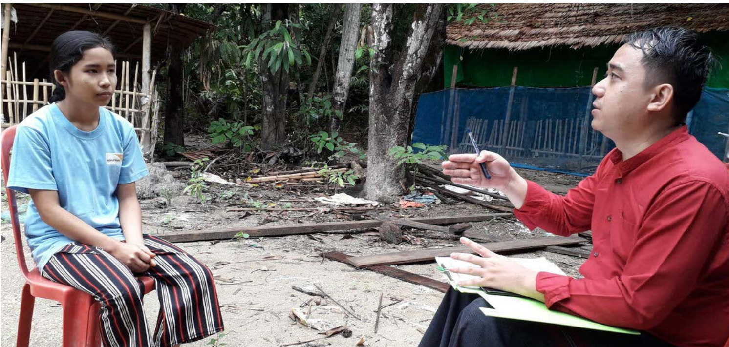
Children are interviewed in Myanmar about their experiences

World Vision considers children and young people active social actors capable of interacting with others and shaping their environments, not helpless, hidden victims of this pandemic. Following this premise, the methodology for this consultation included collaboration between adults and young leaders engaged as peer researchers who conducted interviews with other children and young people over online platforms.