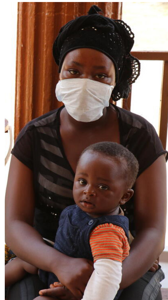
World Vision continues to support health centres in Sierra Leone with COVID-19 prevention materials.