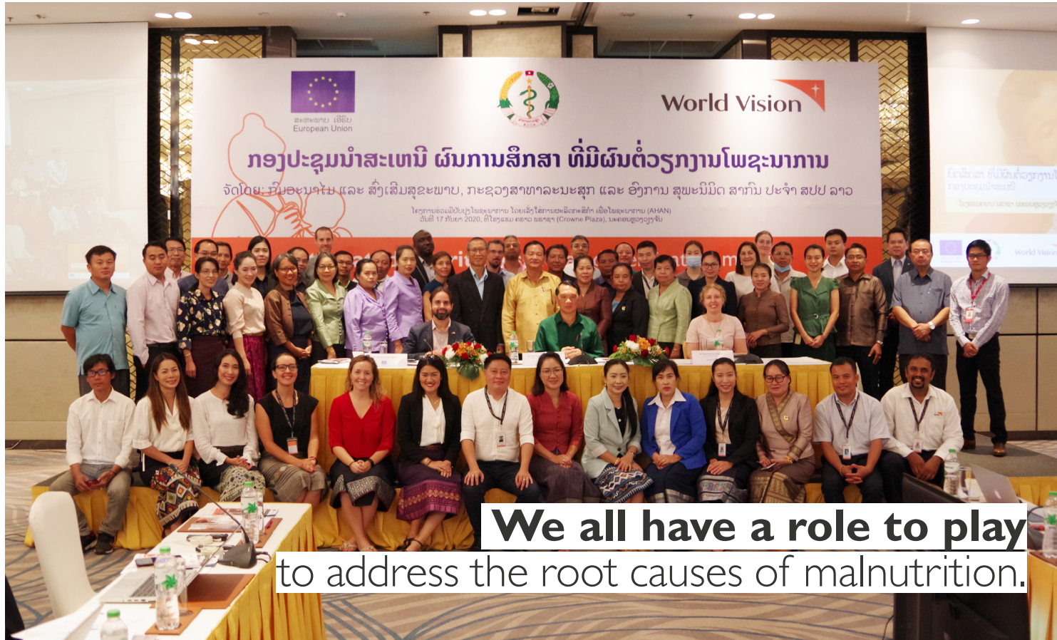
Vientiane Capital, 17 th September 2020.

Almost 90 participants from different line ministries (Ministry of Health, Ministry of Agriculture and Laos Women Union) of the Government of Laos, donors, UN agencies, and development partners were gathered with keen interest to receive research findings conducted by the project on harmful feeding practices, Nutrition Sensitive Value Chain Analysis and Gender Assessment.