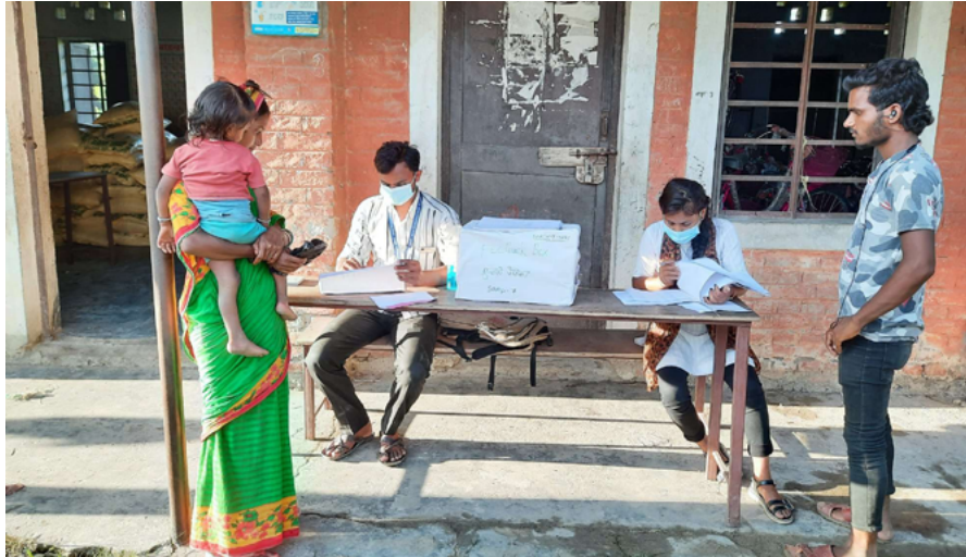
A woman registers herself to receive food supplies from World Vision International Nepal as a part of the Nepal COVER Project: Phase II at Mahottari district.