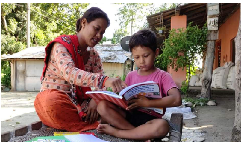
A child being helped by his mother in studying the self-learning materials distributed by World Vision International Nepal in Kailali district.