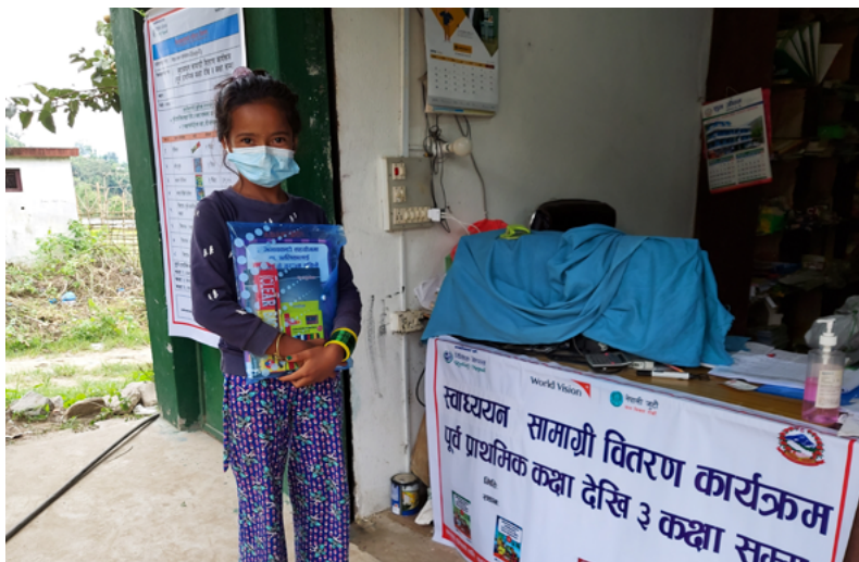
A child receives self learning material from World Vision International Nepal and its partner NGO Relief Nepal at Sindhuli district.