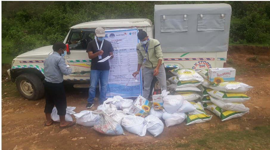
WVI Nepal's partner NGO staff prepare food supplies to be distributed at Achham district on 27 June 2021.