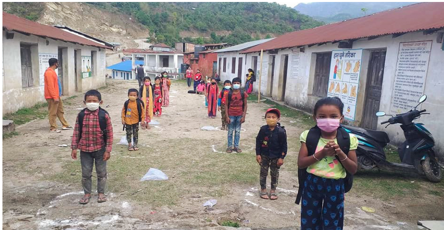
Children stand in queue to receive school bags and hygiene kits at Udayapur district.