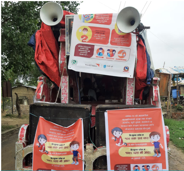
A vehicle disseminating awareness messages on COVID-19 through megaphone and posters in Sarlahi district.