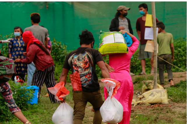
People take home food supplies received from World Vision at Chandragiri, Kathmandu on 17 June 2021.