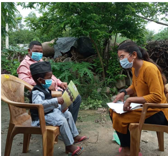
A reading camp facilitator interacts with a child after the handover of learning materials at Kailali district.