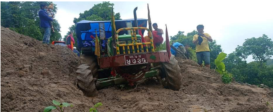
A tractor transporting food supplies stuck in mud following heavy rainfall in Sindhuli district on 30 June 2021.