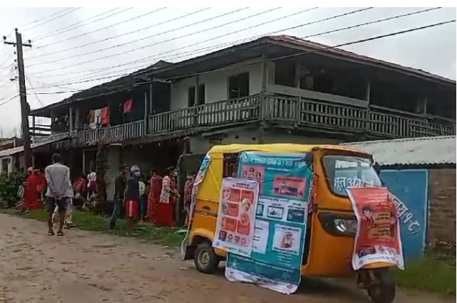
A vehicle disseminating awareness messages on COVID-19 through megaphone and posters in Rautahat district.