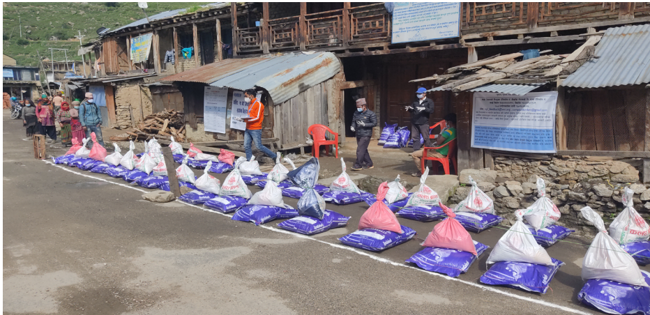
Preparations being done for the distribution of food supplies to 41 households in Jumla district on 4 July 2021.