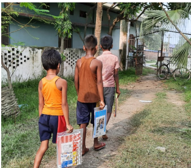
Children return home with self-learning materials received from World Vision at Rautahat district.