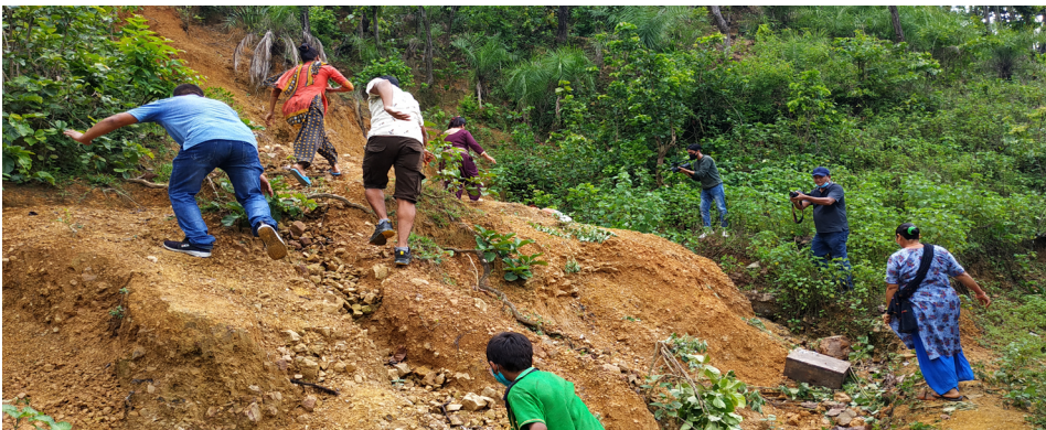
A simulation exercise on landslide prevention being held in Udayapur district on 9 July, 2021.