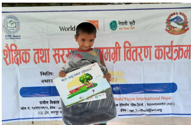
A child receives self-learning materials at Rautahat district on 8 July 2021.