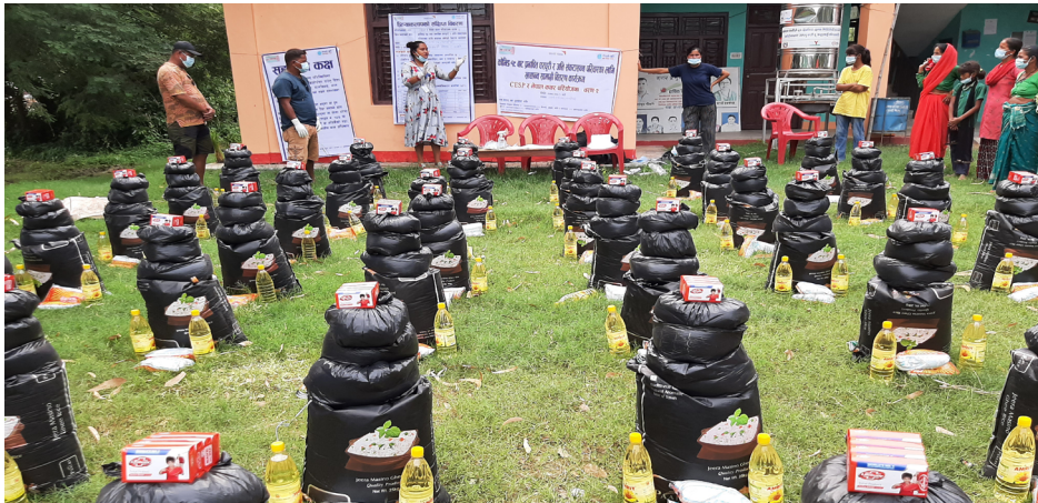
Preparations being done for the distribution of food supplies to COVID-19 impacted households in Kailali district.