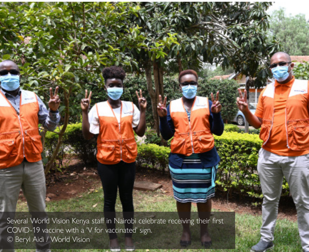
Several World Vision Kenya staff in Nairobi celebrate receiving their first COVID-19 vaccine with a 'V for vaccinated' sign.