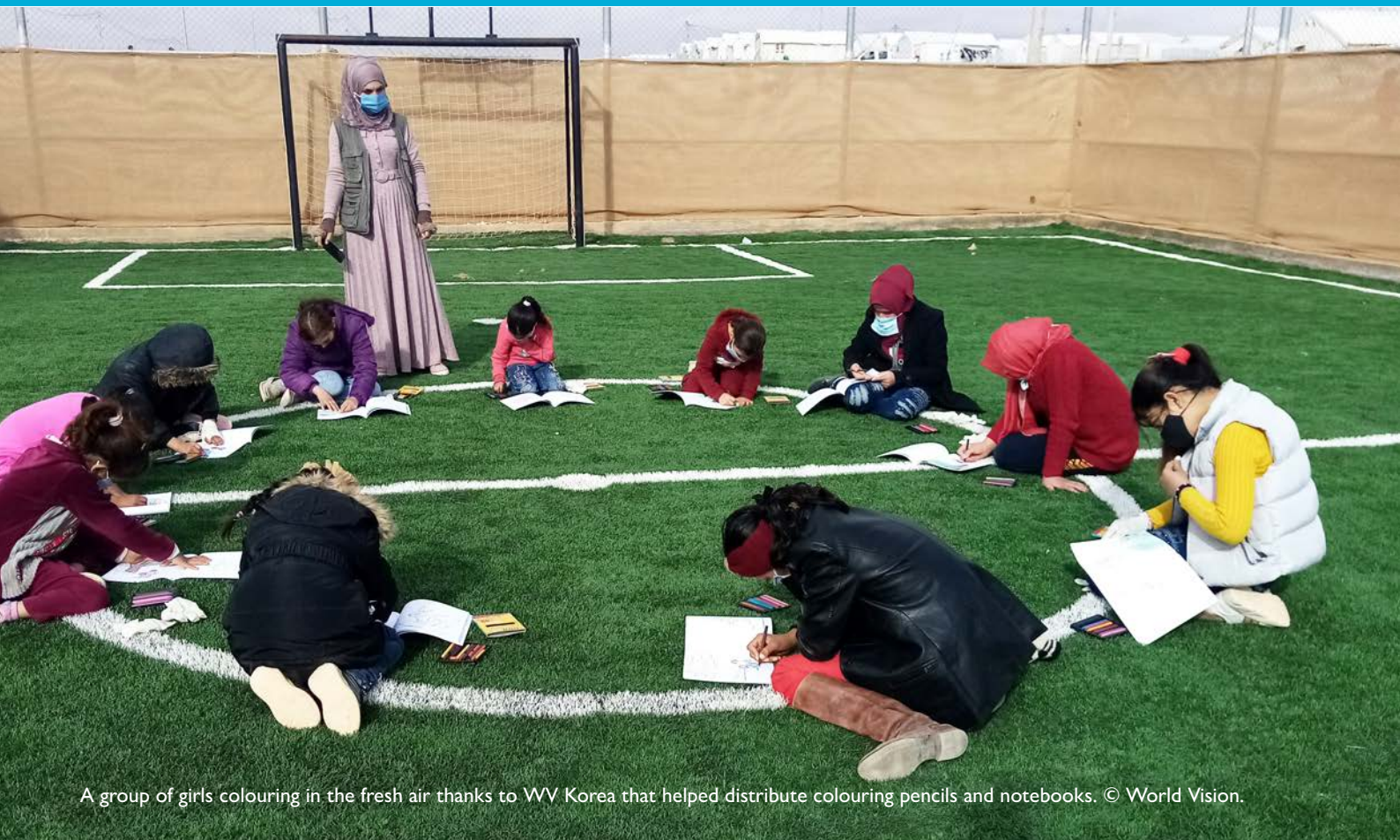
A group of girls colouring in the fresh air thanks to WV Korea that helped distribute colouring pencils and notebooks.