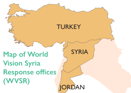
Map of World Vision Syria Response offices (WVSR)

*Donors include private non-sponsorship funds