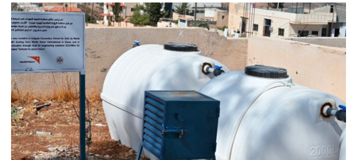
To make the most of the available water resources in Jordan, a black water treatment system was installed in the three schools in Jordan. The treated water will be used for schools' gardens irrigation. The system will be powered by the sun which is one of the many sustainable energy sources.

COVID-19 pandemic affected the world - not only this project's implementation; the number of students who went to schools decreased due to the imposed curfew, students' hygiene awareness had also been positively changed; children now bring their own water bottles instead of using the water available at school. Many students bring their personal sanitiser, and prefer to use it instead of using the washrooms. Some schools even closed their washrooms at some point during the pandemic. All of these behaviours affected the project – it reduced the water produced by the WaSH system.