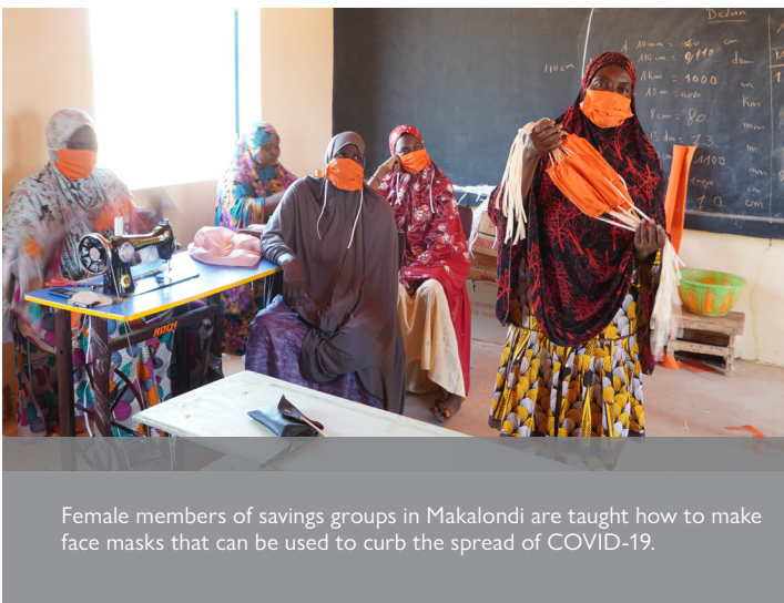
Female members of savings groups in Makalondi are taught how to make face masks that can be used to curb the spread of COVID-19.