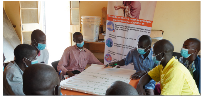
A group of faith leaders discuss disinfection protocols during a training on COVID-19 IPC measures. Faith leaders are a uniquely trusted and important influencer group when it comes to changing behaviors and attitudes that significantly impact community health.