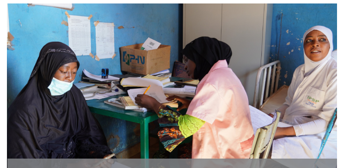
A trained data-collection enumerator interviews HCF staff during the baseline survey.