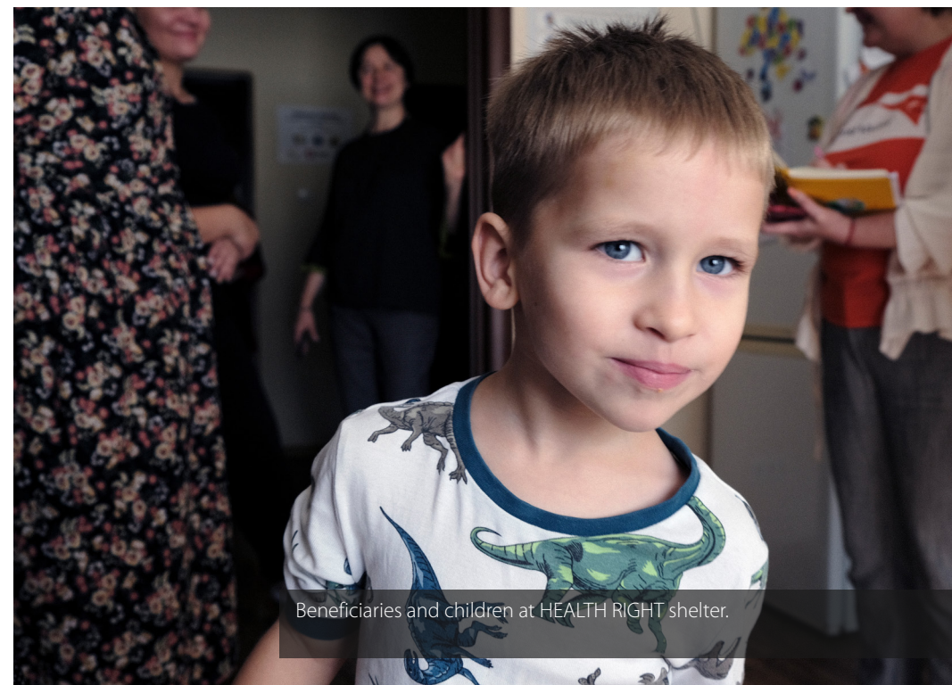
Beneficiaries and children at HEALTH RIGHT shelter.