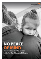
No Peace of Mind Report