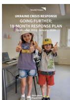
Ukraine Crisis Response 18th Month Response Plan