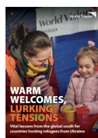
Warm Welcome, Lurking Tensions