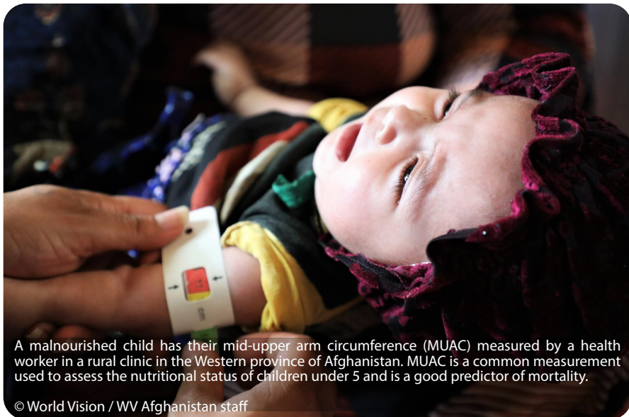
A malnourished child has their mid-upper arm circumference (MUAC) measured by a health worker in a rural clinic in the Western province of Afghanistan. MUAC is a common measurement used to assess the nutritional status of children under 5 and is a good predictor of mortality.