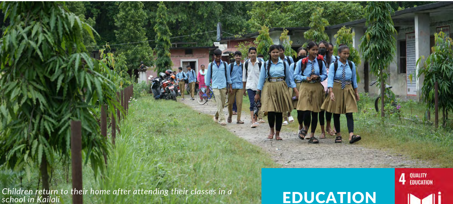
Children return to their home after attending their classes in a school in Kailali