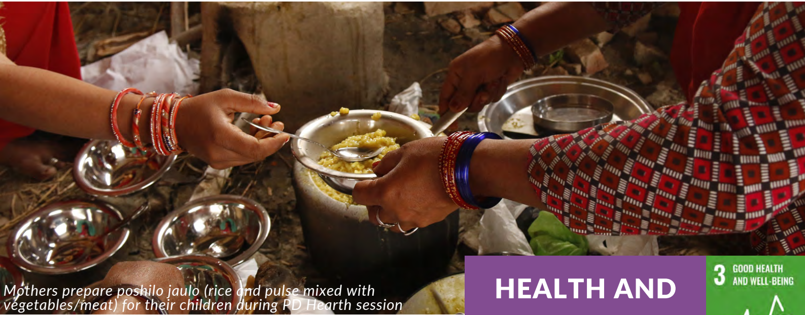
Mothers prepare poshilo jaulo (rice and pulse mixed with vegetables/meat) for their children during PD Hearth session