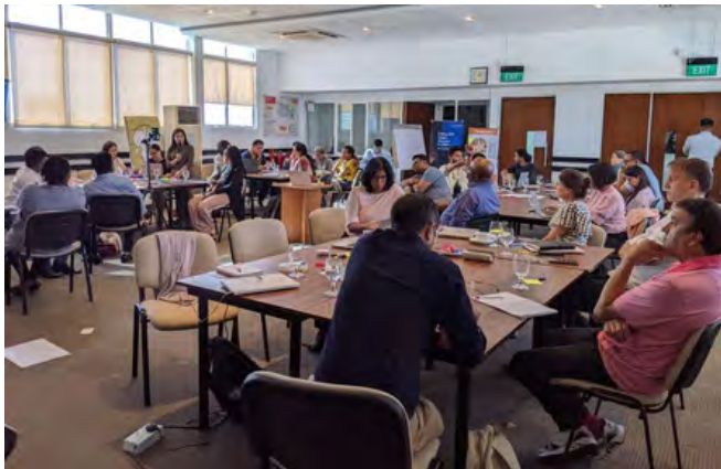
Participants attending the Regional Workshop on ENOUGH Campaign