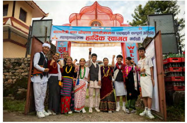
Children and communities celebrate CFLG declaration in Ward 7 of Kirtipur Municipality (left) and Ward 2 of Besisahar Municipality (right)

World Vision International (WVI) Nepal has worked alongside five wards across different districts of Nepal for Child-friendly Local Governance (CFLG) declaration. Between 20 June and 15 September 2023, Ward 1 of Udayapurgadi Rural Municipality (Udayapur), Ward 7 of Kirtipur Municipality (Kathmandu), Ward 5 of Tinpatan Rural Municipality (Sindhuli), Ward 2 and 10 of Besishahar Municipality (Lamjung) were declared CFLG ward after fulfilling all 51 indicators. These indicators are drafted ensuring that every child enjoy their life in all its fullness and progress their rights within the governance framework. WVI Nepal together with its partner NGOs and community groups including child clubs has been continuously engaged with the local governments with a constant effort to ensure all four pillars of child rights.