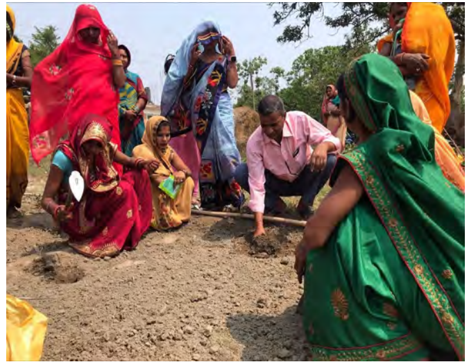
Riya's mother along with other PD Hearth participants learn about kitchen gardening

The PD Hearth session proved transformative as Riya's mother gained valuable insights into preparing affordable and nutritious meals at home. She discovered that the required ingredients were readily available in their locality. Further enhancing their capabilities, Riya's mother participated in a kitchen gardening training. This empowered her to cultivate fruits and vegetables in their small garden, ensuring a fresh and local supply for the family. The positive outcomes were evident as Riya gained 600 grams after the initial 12-day PD Hearth session and an additional 800 grams after 28 days.