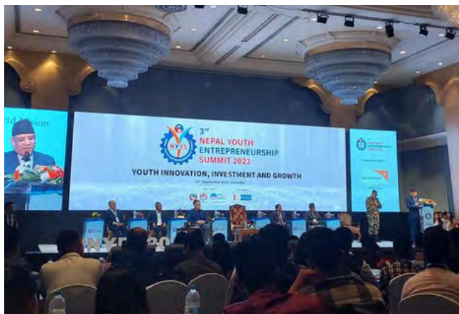
Nepal Youth Entrepreneurship Summit being held themed on Youth Innovation, Investment and Growth

In a collaborative effort, WVI Nepal and National Youth Council/Nepal Business Institute organised the third Nepal Youth Entrepreneurship Summit in Kathmandu on 16 September, 2023. Drawing participation from approximately 400 youth spanning 60 districts, the summit themed on "Youth Innovation: Investment and Growth" sought to inspire young entrepreneurs, address government policy challenges, foster experience sharing and networking, and delve into the realm of youth entrepreneurship.