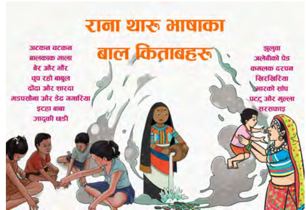
Local Tharu-language books launched in Kanchanpur (left), Cover of Rana Tharu Books (right)

A series of 15 story books have been developed and published in local Tharu language. The books were formally launched in an event in Kanchanpur, Sudurpaschim Province on 4 September 2023. These books include story books, pictorial books, and decodables, all tailored to meet the developmental needs of early graders. Notably, these teaching-learning materials represent the first of their kind in Nepal, specifically crafted for the Tharu community. Through the book, World Vision aims to promote effective and quality learning among the primary-level students of the Tharu community.