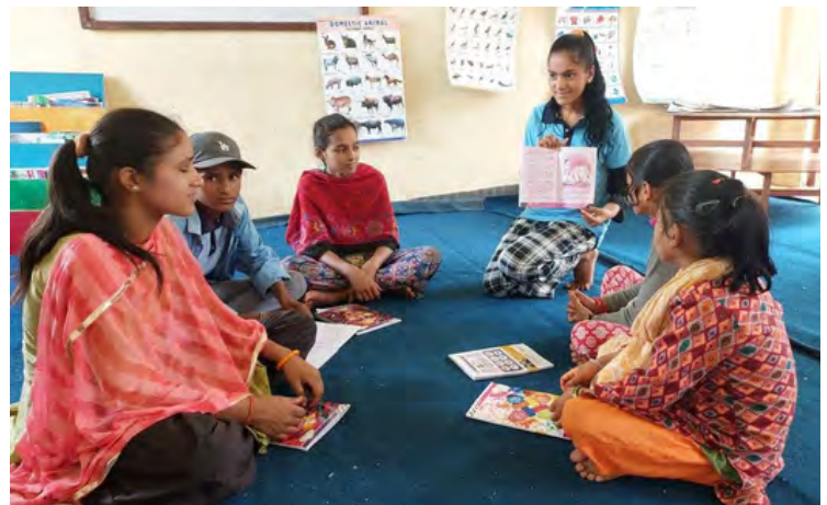
Children leading the Storytelling Campaign in Doti

Marking the International Day of Literacy, a week-long Story Telling Campaign was conducted in Doti district to cultivate reading habit among children. Twenty-five trained Registered Children actively participated, learning and subsequently facilitating storytelling techniques at the community level. These trained Registered Children conducted engaging storytelling sessions in 25 different communities, reaching a total of 625 children through this impactful campaign.