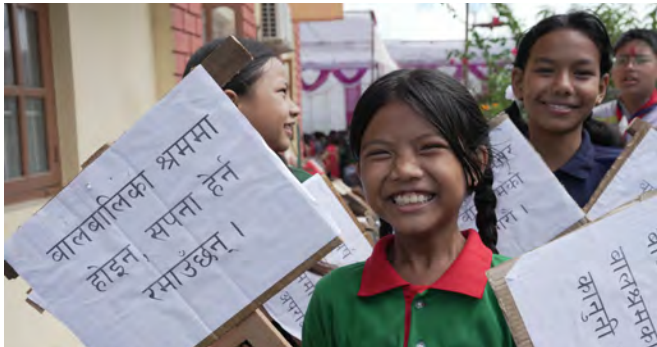
Children hold placards on child rights issue during child labour-free declaration in Chandragiri Municipality-3

World Vision International (WVI) Nepal has worked alongside five wards across different districts of Nepal for Child-friendly Local Governance (CFLG) declaration. Between 20 June and 15 September 2023, Ward 1 of Udayapurgadi Rural Municipality (Udayapur), Ward 7 of Kirtipur Municipality (Kathmandu), Ward 5 of Tinpatan Rural Municipality (Sindhuli), Ward 2 and 10 of Besishahar Municipality (Lamjung) were declared CFLG ward after fulfilling all 51 indicators. These indicators are drafted ensuring that every child enjoy their life in all its fullness and progress their rights within the governance framework. WVI Nepal together with its partner NGOs and community groups including child clubs has been continuously engaged with the local governments with a constant effort to ensure all four pillars of child rights.