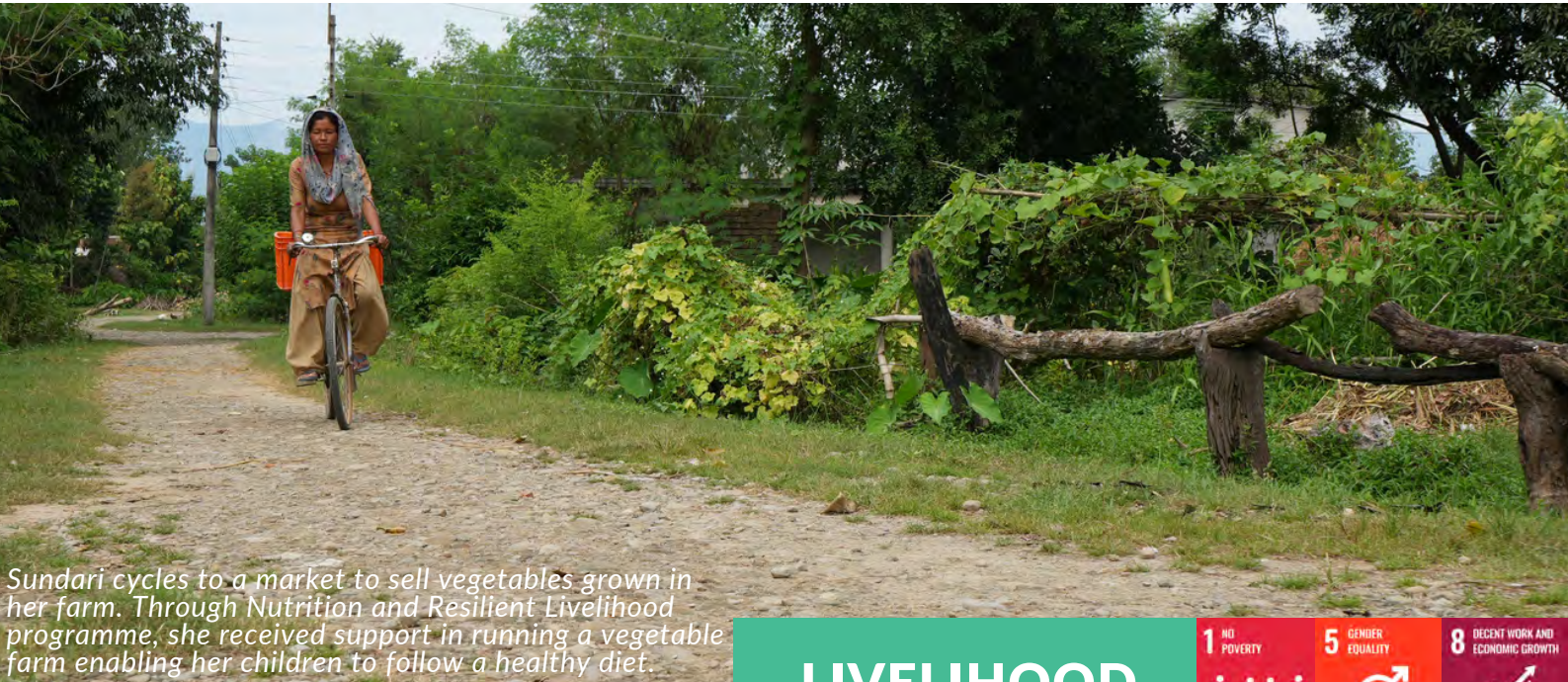
Sundari cycles to a market to sell vegetables grown in her farm. Through Nutrition and Resilient Livelihood programme, she received support in running a vegetable farm enabling her children to follow a healthy diet.