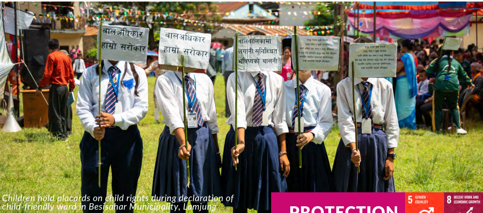
Children hold placards on child rights during declaration of child-friendly ward in Besisahar Municipality, Lamjung