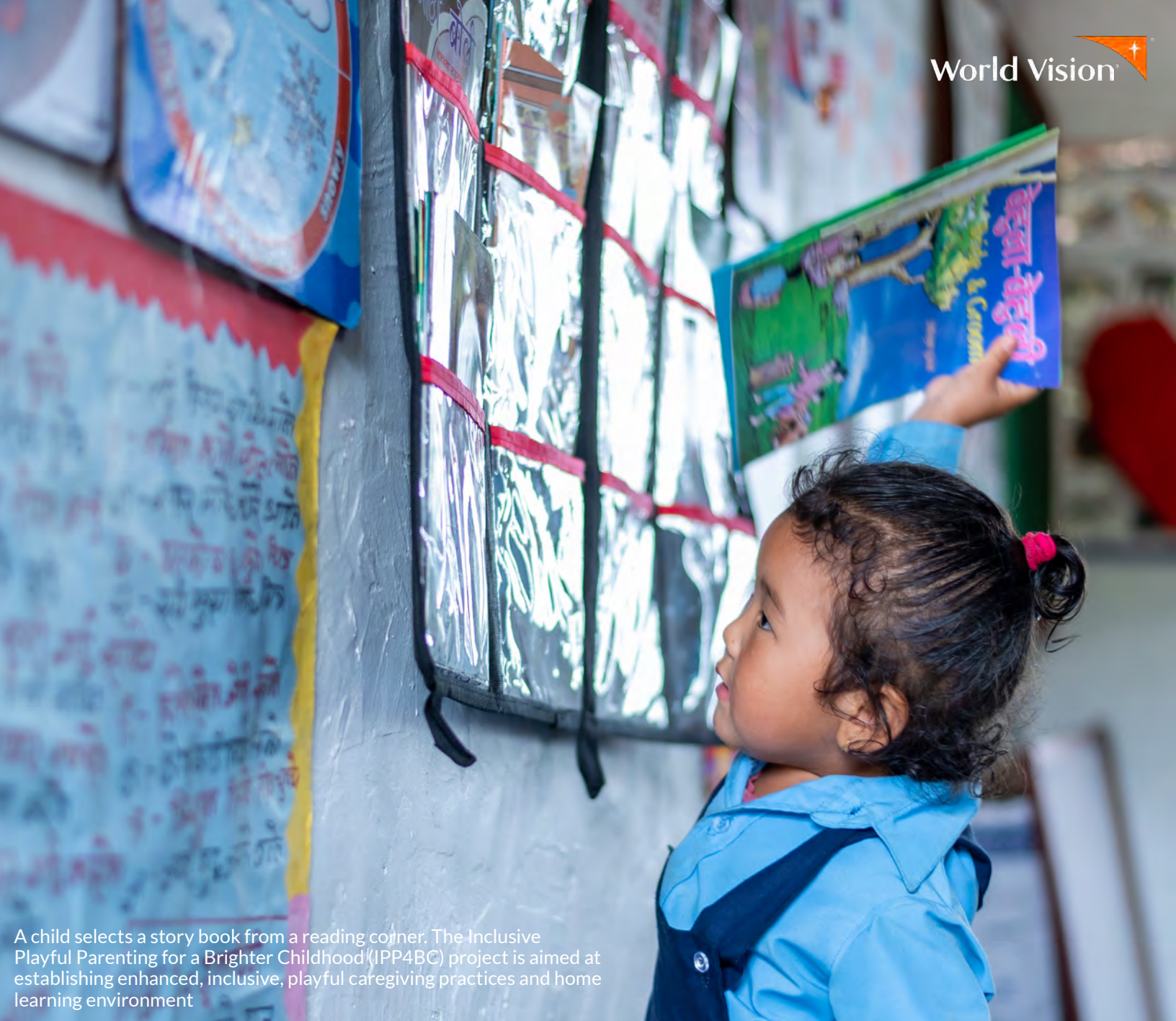
A child selects a story book from a reading corner. The Inclusive Playful Parenting for a Brighter Childhood (IPP4BC) project is aimed at establishing enhanced, inclusive, playful caregiving practices and home learning environment