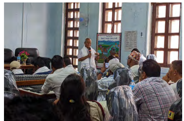
A representative of Planning Commission in Madhesh Province share on malnutrition issues in the province

Inaugurating the ENOUGH campaign in Nepal, a solidarity event was held in Janakpurdham on 16 October, 2023 coinciding with World Food Day 2023 where WVI Nepal collaborated with Directorate of Agriculture and Ministry of Land Management, Agriculture and Cooperative for the event. The vice chair of Province Policy and Planning Commission highlighted the food and nutrition landscape in Madhesh province, stressing the need for collaborative action among different agencies to tackle the issues of hunger and malnutrition in the province. WVI Nepal echoed the ENOUGH campaign pledging support to the Government's efforts in addressing malnutrition and hunger.