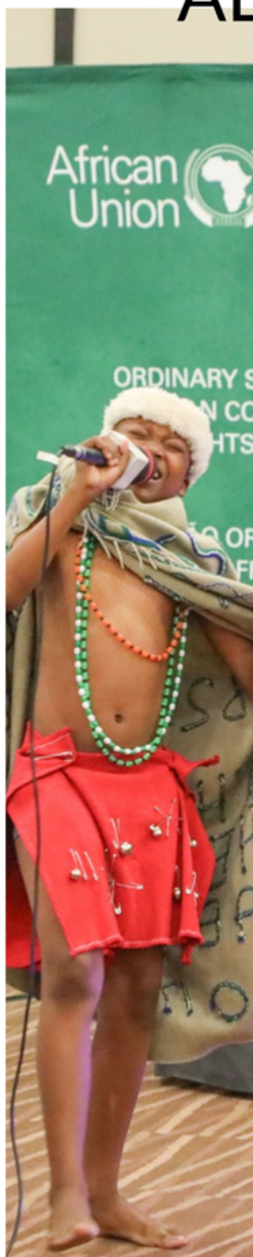
Hiompho, 13 years old Poet and child champion