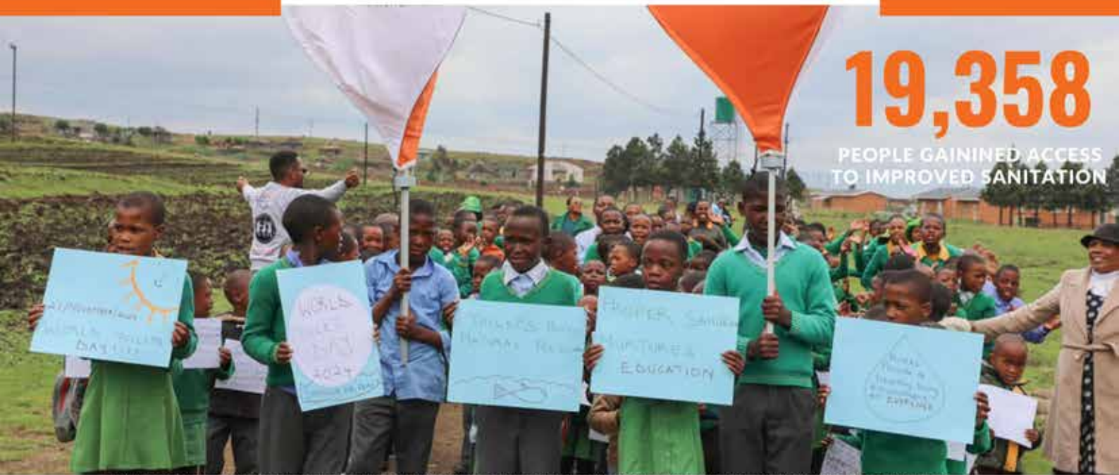
Libbing Primary School, students celebrate World Toilet Day Holding placards with powerful messages, the children are spreading awareness about the importance of sanitation for their health and well-being.

World Vision Lesotho celebrated World Toilet Day in the Menoaneng Area Programme, Mokhotlong, under the theme “Toilets – A Place for Peace.” This day was an opportunity to highlight the crucial role that sanitation plays in ensuring dignity, health, and safety for communities. At World Vision Lesotho, we remain dedicated to improving access to safe and dignified sanitation, empowering communities to thrive. Since the start of our current strategy cycle (2021–2025), we have made significant strides, providing 195 schools with sanitation facilities and 19,358 people gaining access to improved sanitation through our WASH programme.