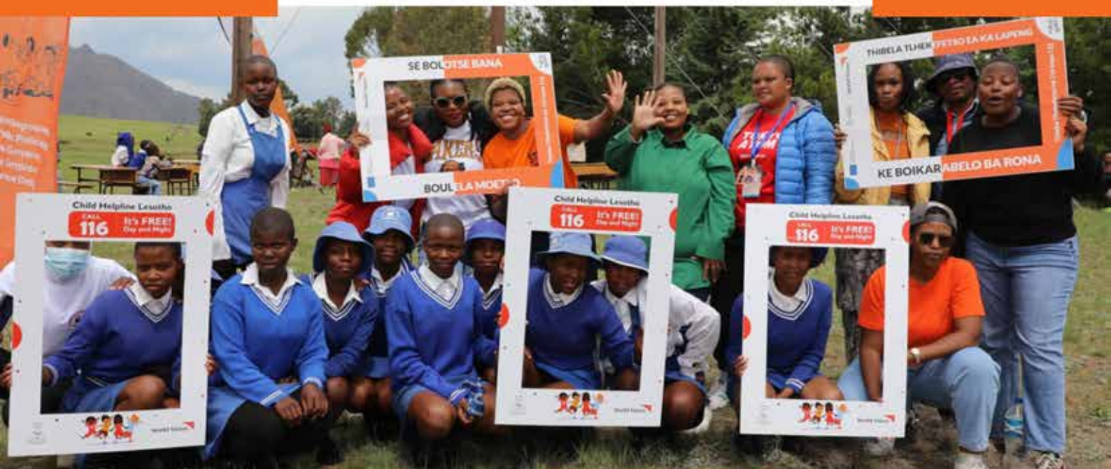
World Vision Lesotho, in collaboration with our partners, joined the vibrant community of Ha Mohlakoana at Bolula Primary School in Quthing district to stand united against abuse under the theme: Unite to end violence against women and children.

From November 25 to December 10, 2024, World Vision Lesotho, in partnership with the European Union in Lesotho and other partners, joined the #16DaysOfActivism campaign to raise awareness and advocate for the elimination of gender-based violence (GBV). This global campaign highlights the urgent need to address the violence and abuse that disproportionately affects women and children. Gender-based violence is not just a violation of human rights—it is a significant barrier to achieving gender equality and building a just, sustainable society. Empowering women and girls is critical for creating a future where everyone can live free from fear, violence, and discrimination.