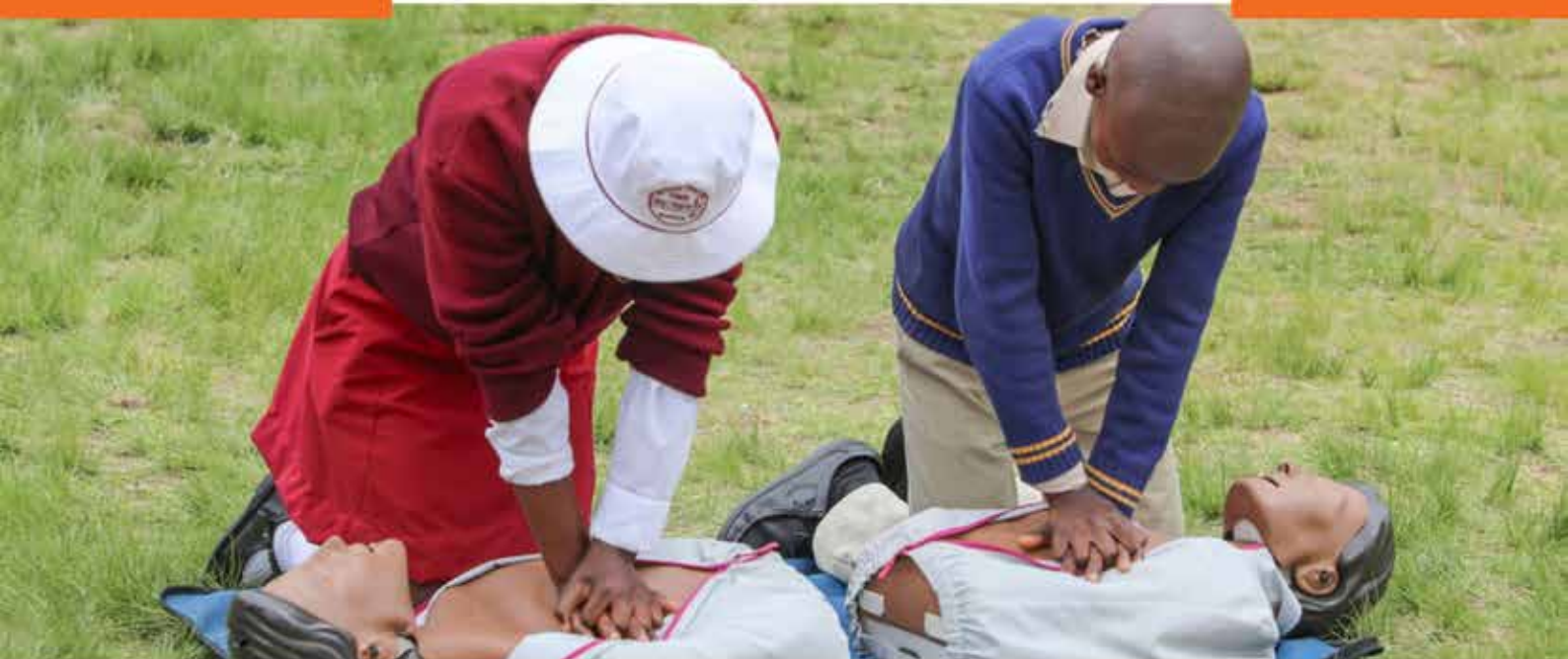
Children showcased their preparedness by participating in simulations, demonstrating skills to handle emergencies. Their readiness ensures safer communities for everyone!

Empowering the next generation for a resilient future