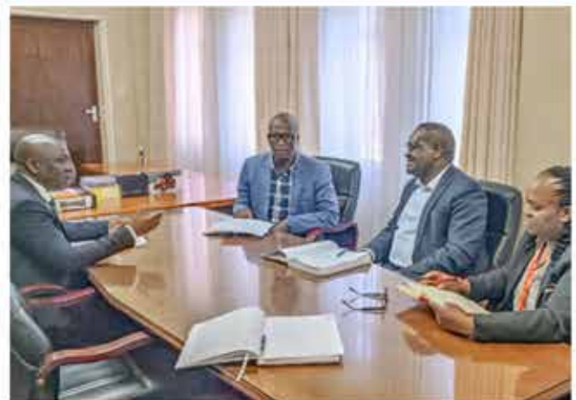
Meeting with the Minister of Agriculture, Food Security and Nutrition

During our meeting, we shared the vision behind the #ENOUGH Campaign, which seeks to raise awareness about the urgency of addressing hunger and malnutrition in Lesotho, particularly for children who are most at risk. We emphasized the need for a unified approach that includes both government action and community-based solutions to ensure sustainable food security. In this context, we discussed practical strategies that can be implemented to increase access to nutritious food, improve agricultural practices, and create resilient systems to support communities in the face of ongoing challenges like droughts and climate change.