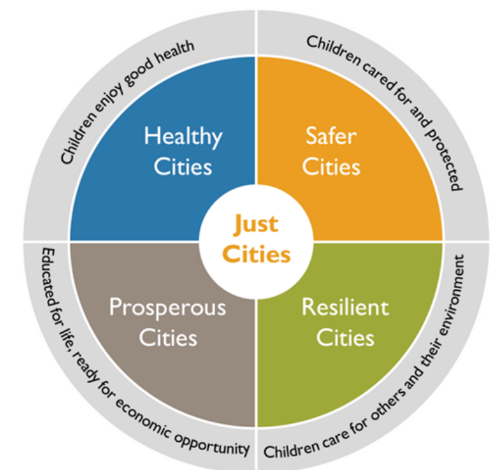
'World Vision's Cities for Children' Framework