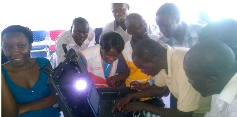
Staff of world vision learning to operate the digischool