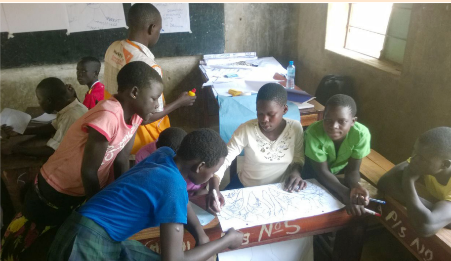
Adolescent girls in a session during the Empowering Children as Peace builders (ECaP) training.