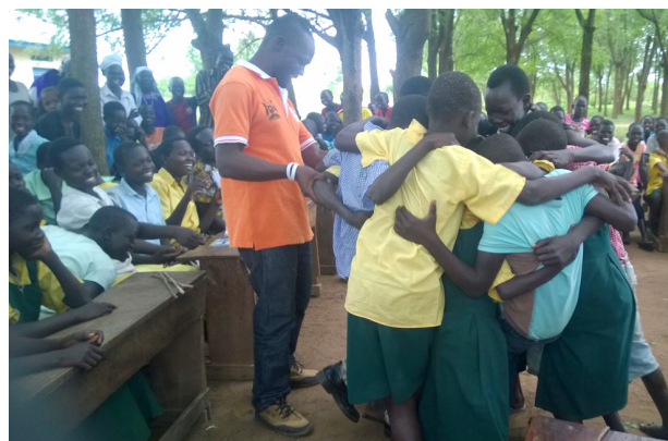
Children from Ajugopi in a participative game during a sensitisation on peace building

Another illustration used was for a group of people to fit within a small squared box that was drawn on the ground by the session facilitator. The square represented their community or village. They had to find suitable means of fitting within this space without displacing anyone. This could be equated to the challenge that communities often,