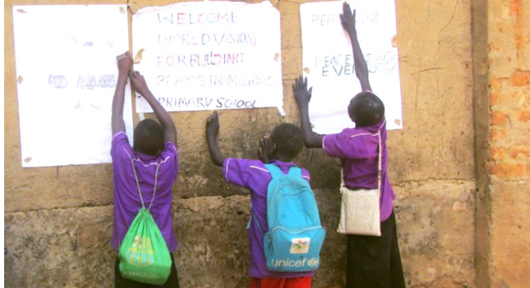
Children from Mungula 1 Peace Club displaying posters with messages of peace at their school.

language the other would think they were being mocked and insulted. Teachers would spend half of the allotted lesson time solving cases of fighting among children. Some teachers almost turned down their appointments for fear of the conflict situation in this school. One teacher shared his worries.