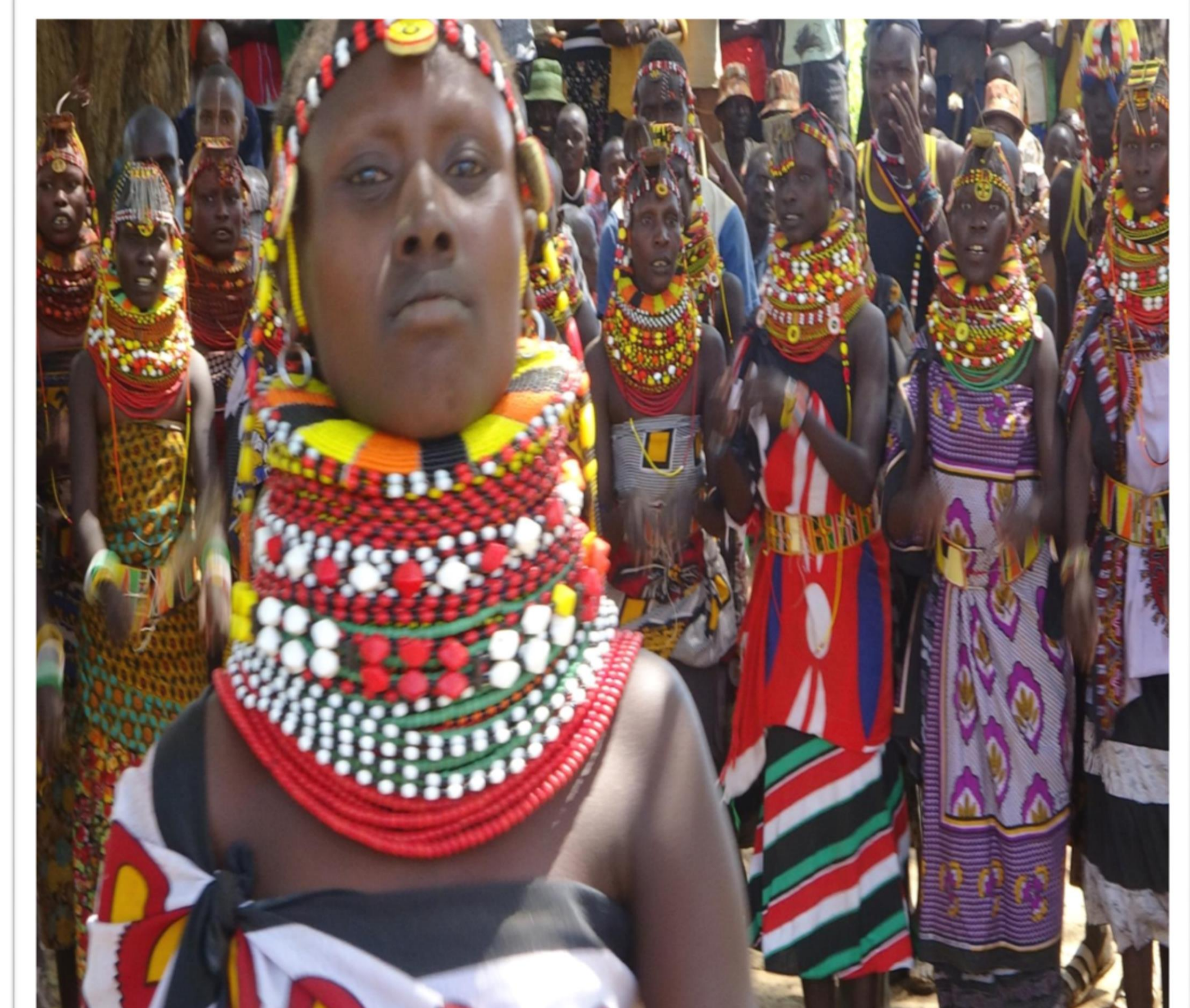
Figure 2 : Turkana Women at a community gathering