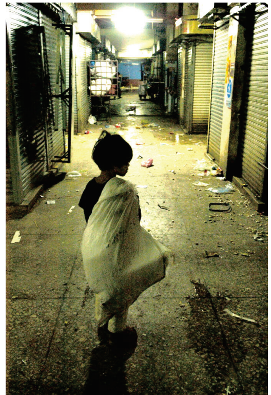
Life on the streets: a young girl searching for items she can sell. Cambodia

The group that suffers most from the stark inequities in the world is children. 13 The ‘most vulnerable children’ are defined by World Vision as those whose quality of life and ability to fulfil their potential is most limited by extreme deprivation and violation of their rights. These children often live in catastrophic situations and relationships characterised by violence, abuse, neglect, exploitation, exclusion and discrimination. The most at risk are defined not only by depth of economic poverty, but also typically include those living in remote rural locations or urban slums; those in highly vulnerable groups such as