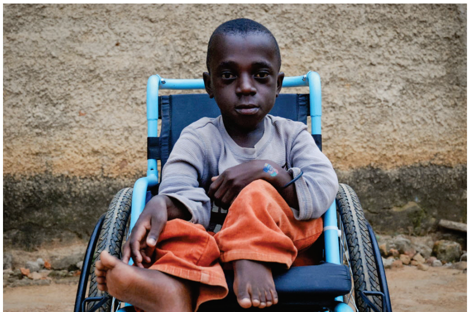
Disability can add to vulnerability, Zambia

The second question addressed by the study, and the one explored in this second paper, was: How can cross-sector partnerships help to meet the needs of the most vulnerable (and so help further the goal of ending poverty)? The 'most vulnerable children' are defined by World Vision as those whose quality of life and ability to fulfil their potential is most limited by extreme deprivation and violation of their rights.