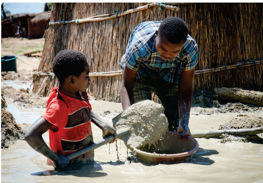
Child labour, Mozambique