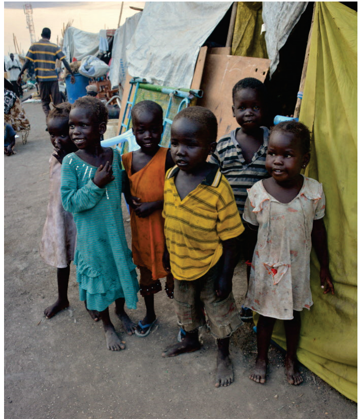
UN Protection of Civilians Area in Malakal, South Sudan

(including those with business partners) to make strong contributions here, building capacity in government as well as in the local business sectors. Such investments can have important long-term returns for business, for example, through the development of supply chains, employee skills and the regulatory and financial environment (and, because of this, interventions of this type might even be argued by some to fall within the market-based 'spectrum').