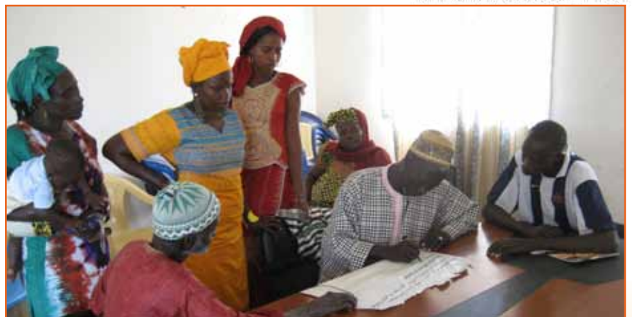
Mbella Farmer Leader Association