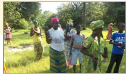
Reforestation in Kolda