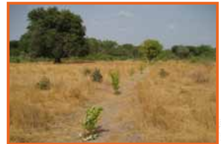
Fire corridor in Dabo