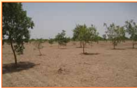
FMNR in Kaffrine