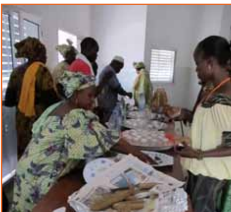
Acacia Colei transformation in Kaffrine