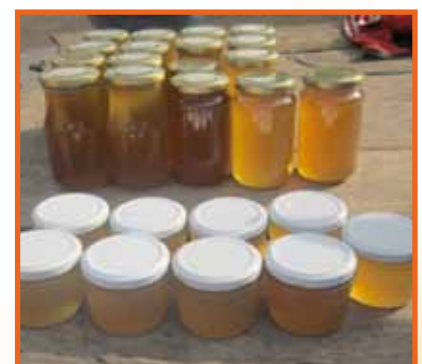
Honey production in Kaffrine