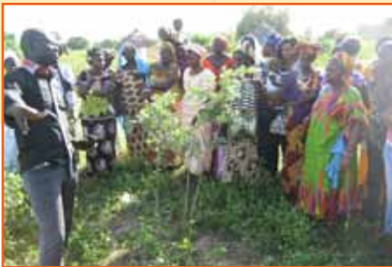
Training women on FMNR in Fatick